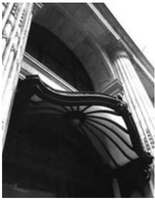
A photo of the entrance to the CUNY Graduate Center, the location of the NYIEC Technical Conference.